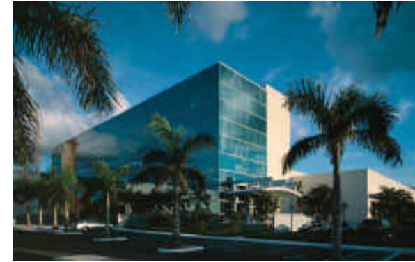
One of Aeroterm's new buildings in MIA.