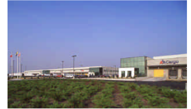
Aeroterm's new buildings at EWR.

Aeroterm recently completed the acquisition of seven more buildings at three airports. This transaction gives Aeroterm a presence at John F. Kennedy International Airport (JFK) in New York, and Newark International Airport (EWR) in New Jersey. The transaction also expands our portfolio at Miami International Airport (MIA) in Florida.