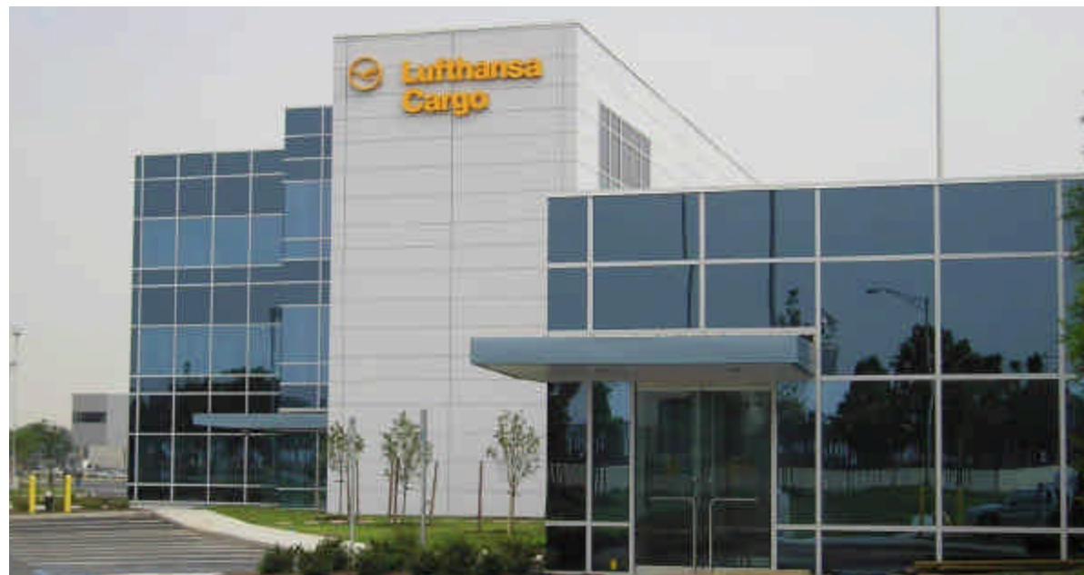
One of the new buildings at JFK.

the northwest of the passenger terminals in the cargo area and are known as Buildings 21 and 23.