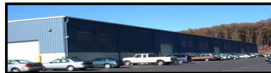
Top: Front view of facility at Will Rogers World Airport Bottom: Rear view of Boylston facility

We are happy to report a first quarter acquisition volume of approximately $22 million in three locations. Facilities in Oklahoma City, Oklahoma and